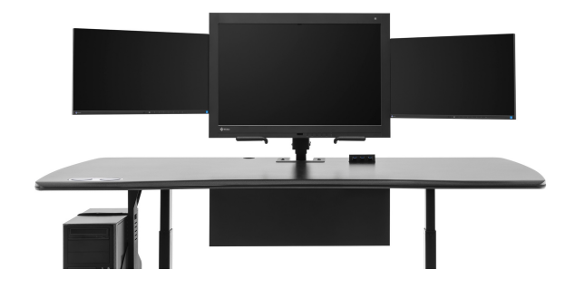
ComfortView™ L4S Monitor Mount