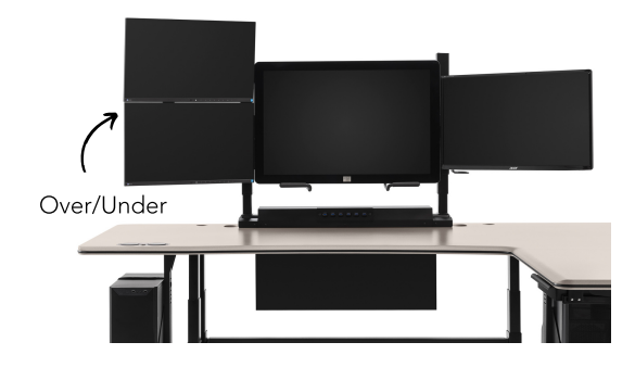
ComfortView™ L4 Monitor Mount