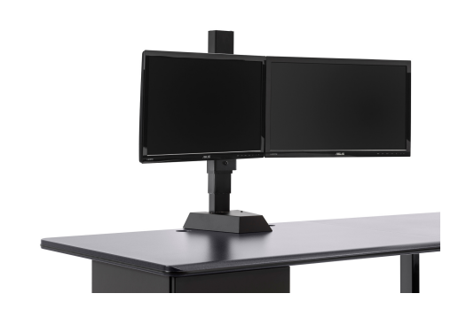
ComfortView™ L2 Monitor Mount