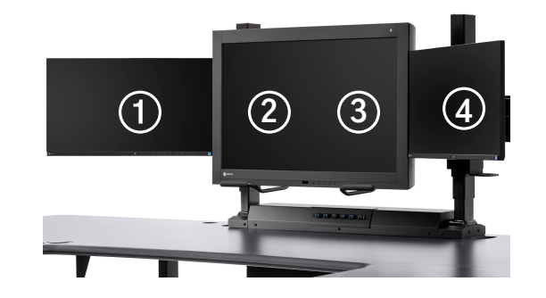
XL or dual display monitors such as Barco Fusion monitors account for two monitor spaces (as seen in the middle monitor above)