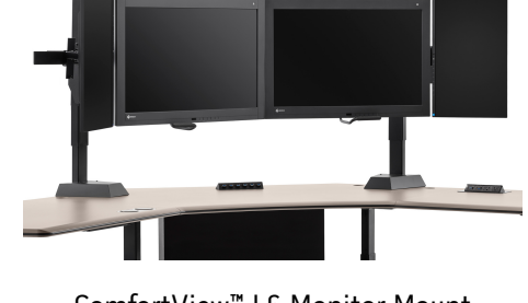
ComfortView™ L6 Monitor Mount